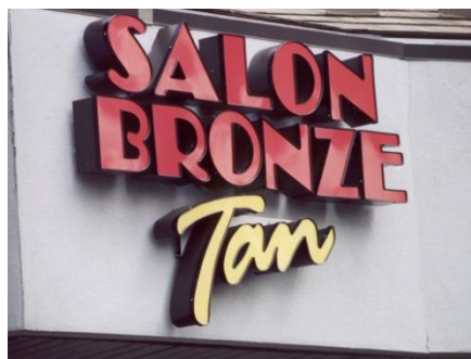
Example of Channel Lettering

CHANNEL LETTERING. A sign design technique involving the installation of three-dimensional lettering against a background, typically a sign face or building façade.