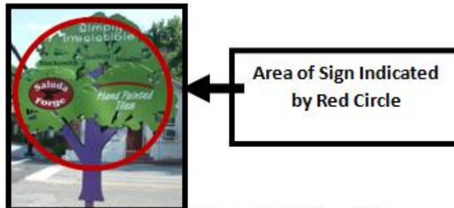
Example Illustrating Measurement of the Area of an Irregularly Shaped Sign

SIGN AREA. The size of a sign in square feet as computed by the area of not more than two standard geometric shapes (specifically circles, squares, rectangles, or triangles) that encompass the shape of the sign exclusive of the supporting structure.